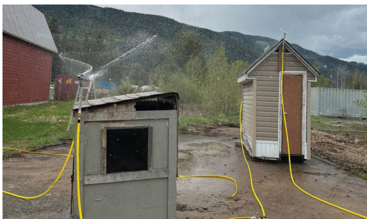
A public FireSmart demonstration shows how structure protection sprinkler kits help safeguard homes from wildfire.

equipment. In some cases, kits were donated to homeowners unable to safely install them on their own, ensuring protection was available regardless of physical ability or financial means. The project also created opportunities for fire crews to connect with residents and share FireSmart education during the off-season.